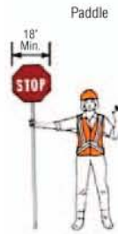
To Stop Traffic